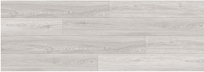
888C01/888C01-WA Midnight Mist