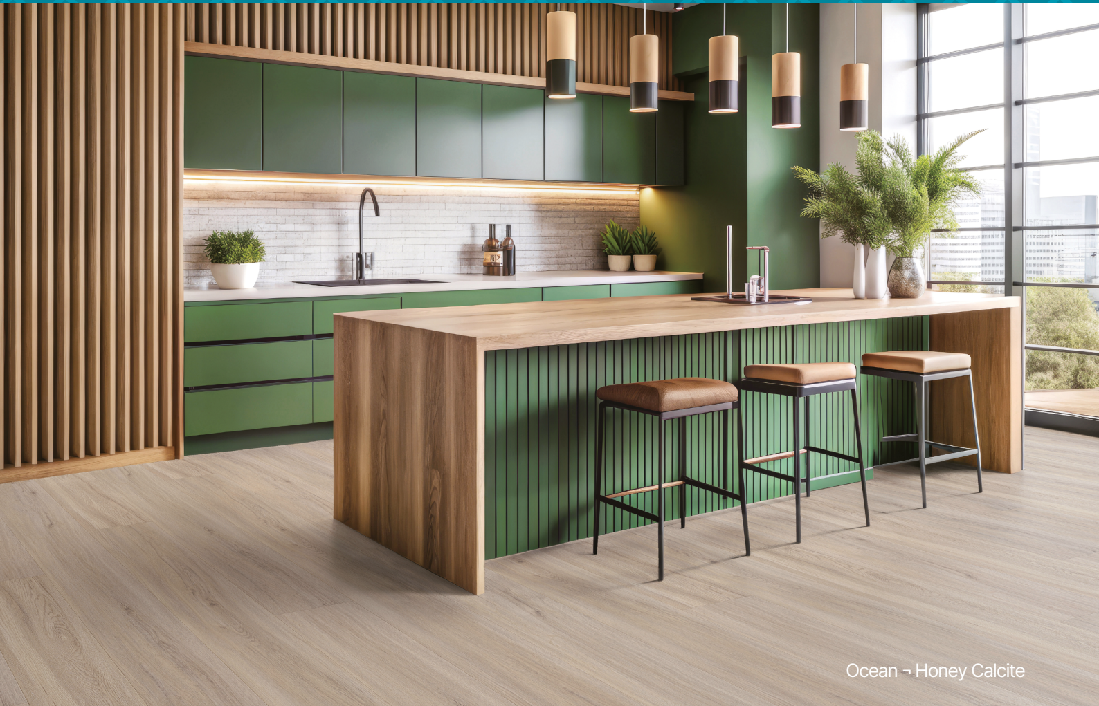
Ocean - Honey Calcite