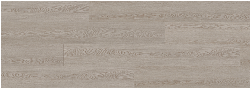
888C03/888C03-WA Ashen Haze