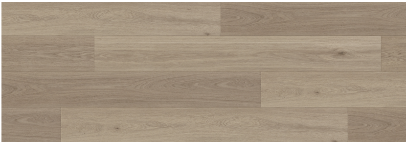
888C04/888C04-WA Beach Stone