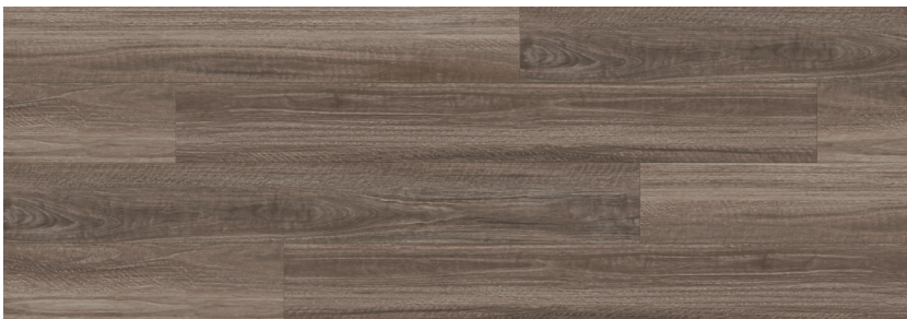
888C06/888C06-WA Seaside Spotted Gum